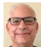
Guy Lombardo Membership